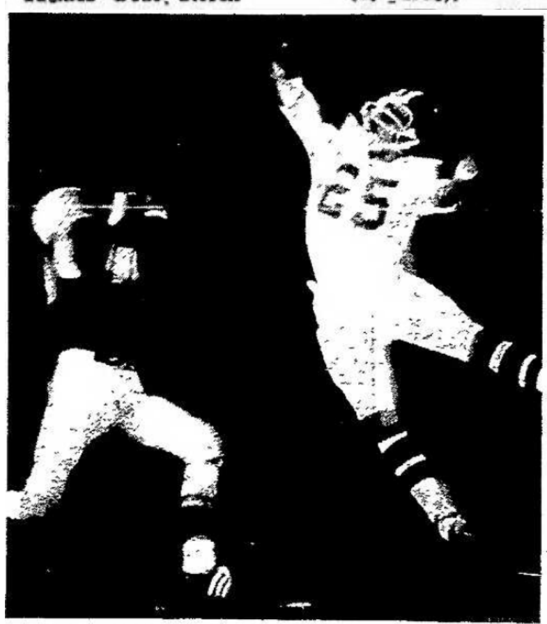
TWO GREAT EFFORTS - Glendale receiving star Gary Kizina makes a spectacular catch for the first touchdown of last night's game. West Branch de-