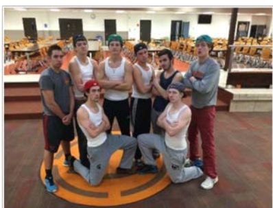
Senior boys create a dance team to support the girls' basketball team versus Northview