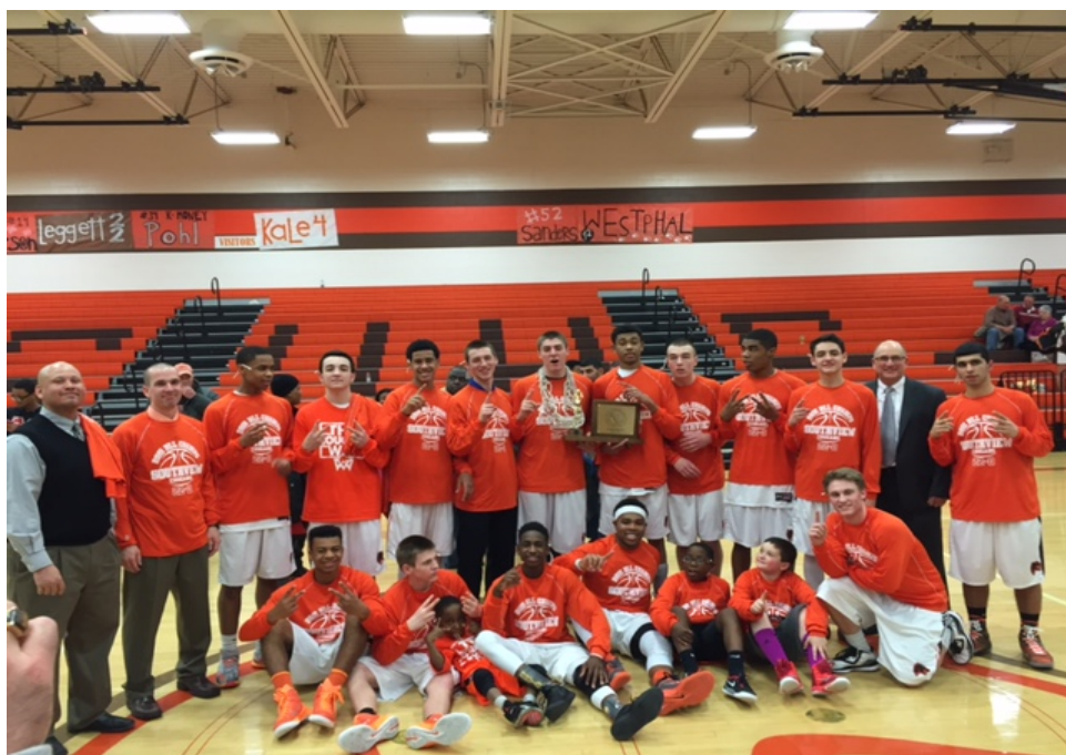
BOYS BASKETBALL TEAM NLL CHAMPIONS