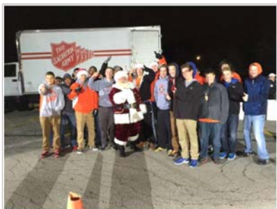
Baseball team volunteers with Toys for Tots during the holiday season