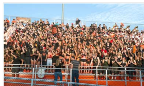
Students Section at First Home Game at the New Mel Nusbaum Stadium

Cougar Club has committed $25,000 ($5000 per year for 5 years) to the Athletic Foundation earmarked for Southview Athletic Facilities.