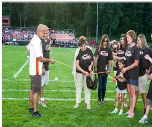
Ribbon Cutting of the Stadium

Big Holiday Event at first team basketball game will be on Saturday, December 6, 2014.