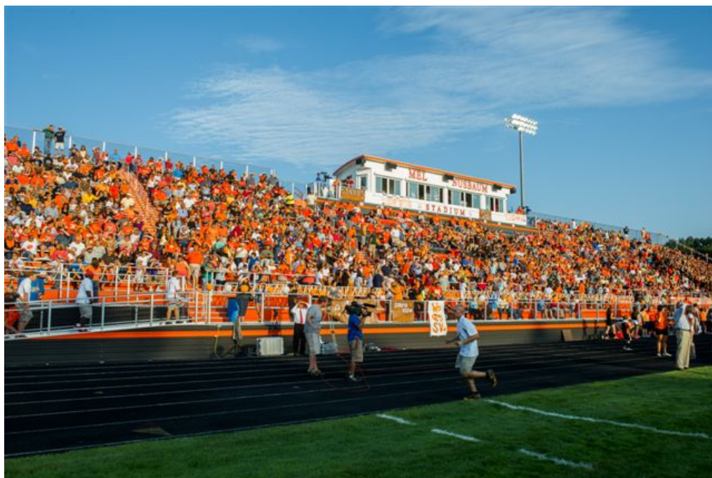
MEL NUSBAUM STADIUM HOME GAME AT SOUTHVIEW