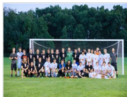
Boys Soccer 2014 Season.

The players continue to work hard in order to continue the tradition and to make sure Southview Soccer is represented well.