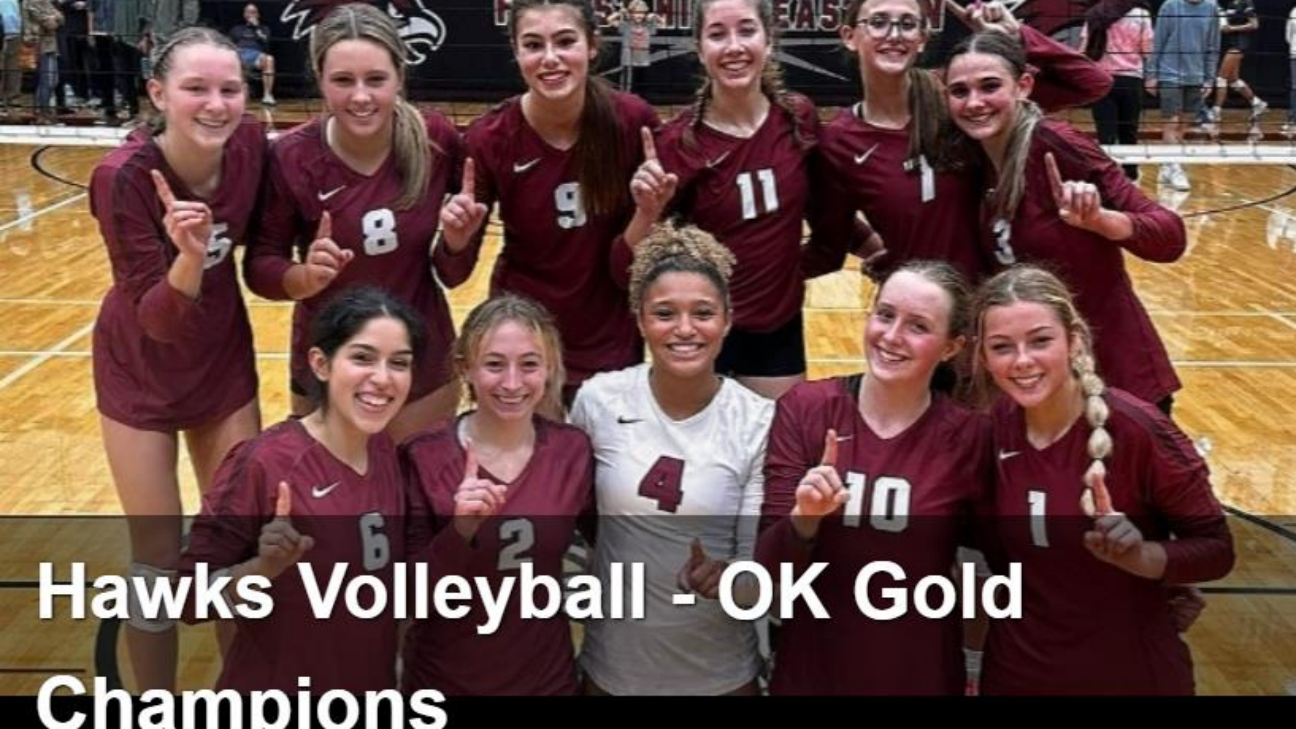
Hawks Volleyball - OK Gold Champions