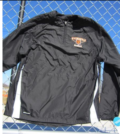
Wind shirt-Conversion 9112 Embroidery Cross Bat