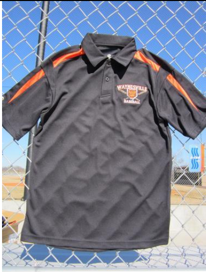
Holloway Polo-2454 Black Org. Emb logo