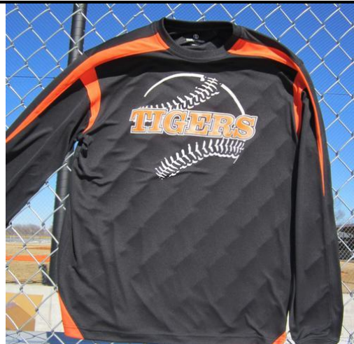
Holloway 2433 Long S Black-Orange