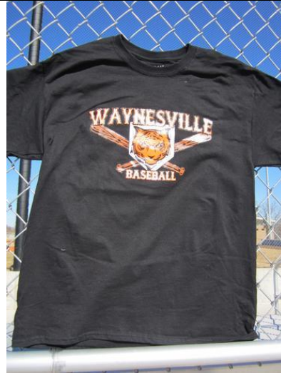
Black Short Sleeve T-shirt Cross Bat Design FullColor