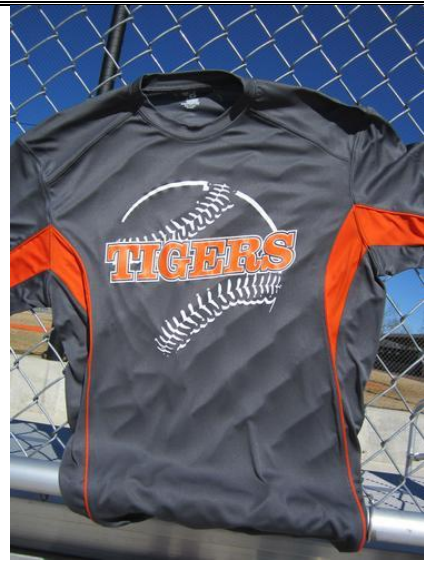
Badger 4147 Short Sleeve Graphite-Orange