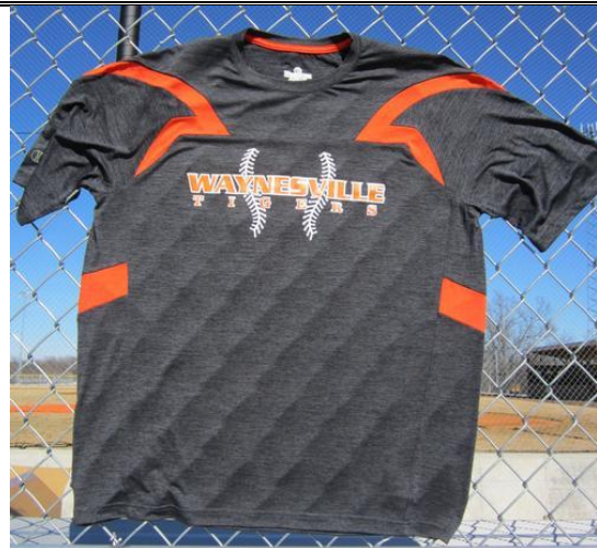
Holloway Launch 2404 Black Org. Seams Logo