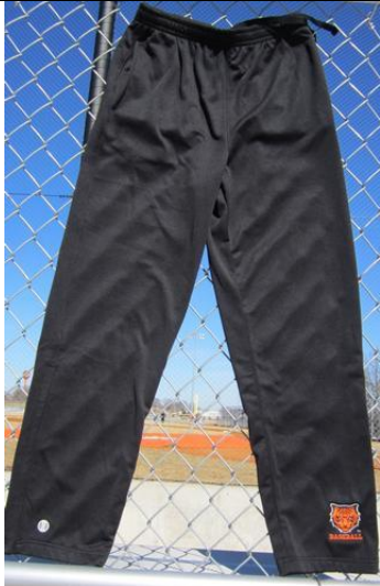
Holloway Sweatpant 2481 Emb. Tiger Head Leg

If you would like to purchase any of the baseball items please fill out the baseball order form (located under the Varsity Baseball, Team Files on waynesvilletigerathletics.org) and submit in an envelope with payment (checks made out to B&B Creative Designs) by Saturday, March 15 an noon. You can drop the envelope off at the field Tuesday, Thursday, Friday from 3-7:30 or at B&B Creative Designs in St. Robert. Orders should be able for pickup within a couple weeks from Saturday.