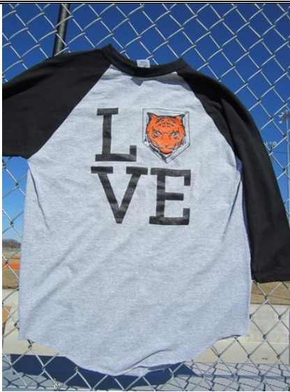
¾ Sleeve Undershirt 420 Grey-Black Sleeves Love (It says White-Black on form)