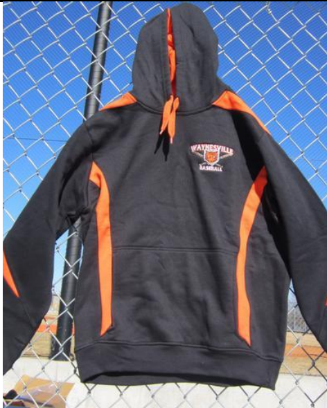
Holloway Hood 2489 Emb. Cross Bat Front