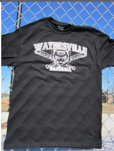
Black SS T-shirt Cross Bat Design 1-color