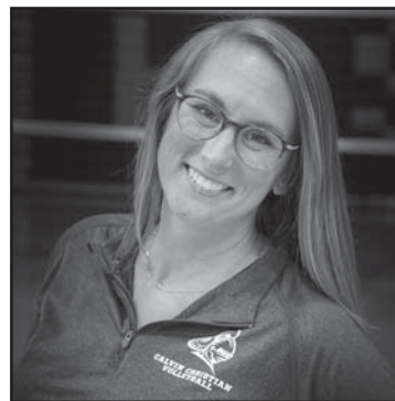
Varsity Head Coach